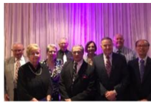
The FITT group with partners